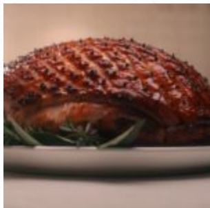
AUNTY PRU'S CAPILANO HONEY MUSTARD GLAZED HAM